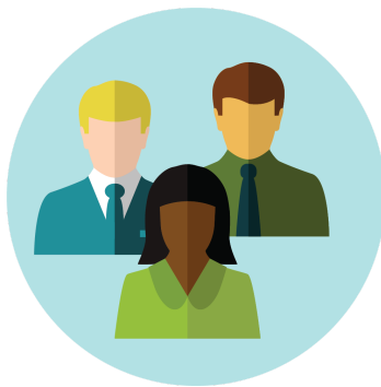
Investment Policy Committee