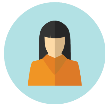
Central Rebalancing Group

Smartleaf is more than a rebalancing engine. It is an enterprise platform that enables firms to divide responsibility for managing portfolios among different groups, allowing each to focus on what they do best: